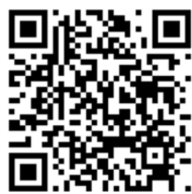
Spring Training Sign-Ups